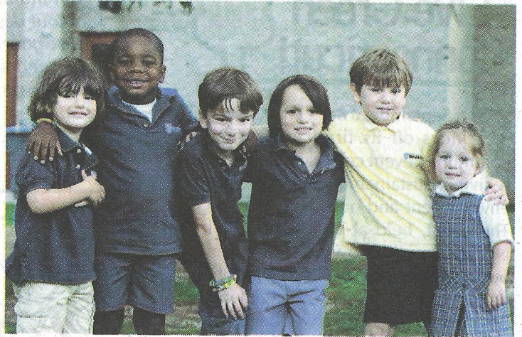
Whitby School Children

Since 1958, Whitby School, located on 25 beautiful acres in Greenwich, has created an environment for students aged 14 months through grade eight that excites their intellect, fosters self-esteem and inspires a passion for learning, yielding academic and personal success. Recognized as the birthplace of the American Montessori Society (AMS) and offering the